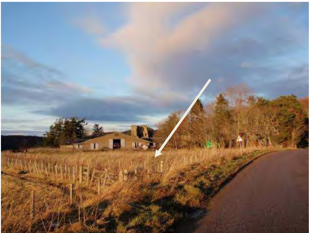
Fig. 2- Site from B 9136 (Drumin Castle behind)